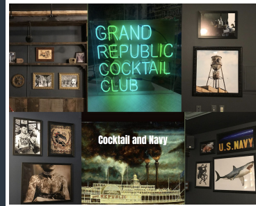
Grand Republic Cocktail Club 19 Greenpoint Avenue