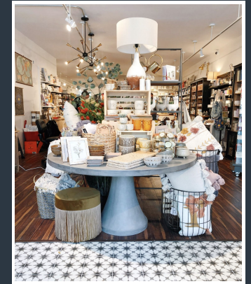
Lockwood 98 Greenpoint Avenue