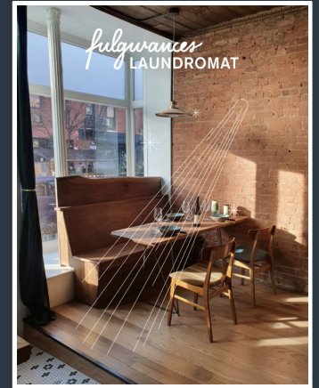
Fulgurances 132 Franklin Street