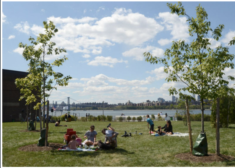
Transmitter park West St. bet. Kent St. and Greenpoint Avenue Brooklyn, 11222