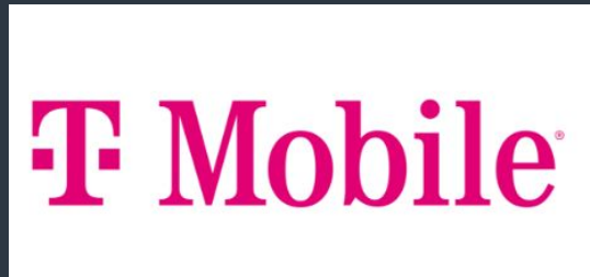
T Mobile 771 Manhattan Avenue