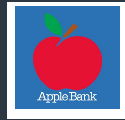
Apple Bank 776 Manhattan Avenue