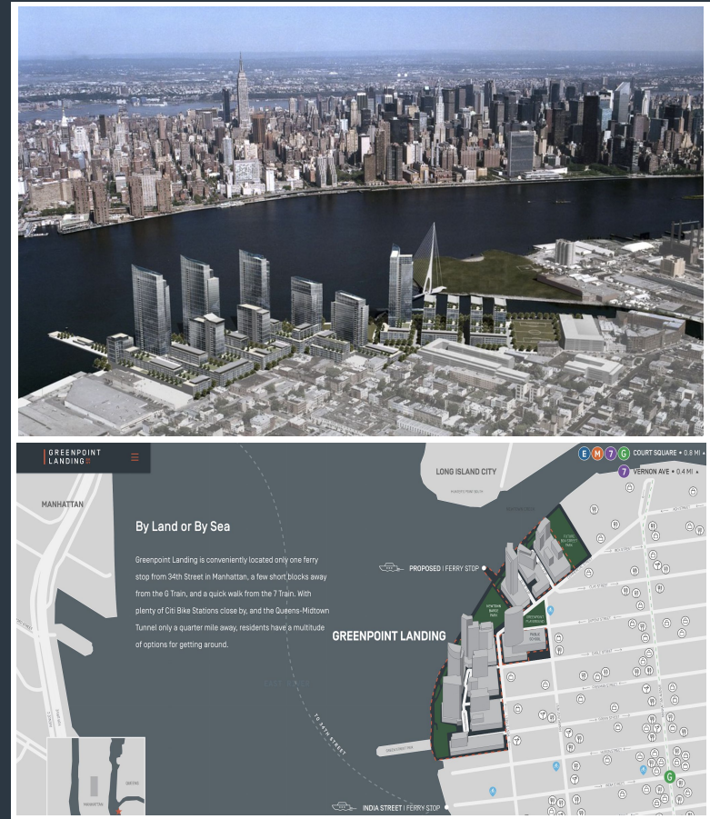
Greenpoint Landing proposed plans