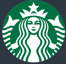
Starbucks 910 Manhattan Avenue