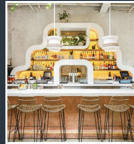
Oxomoco 128 Greenpoint Avenue