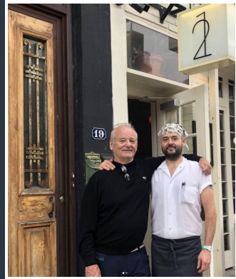
Bar 21 21 Greenpoint Avenue